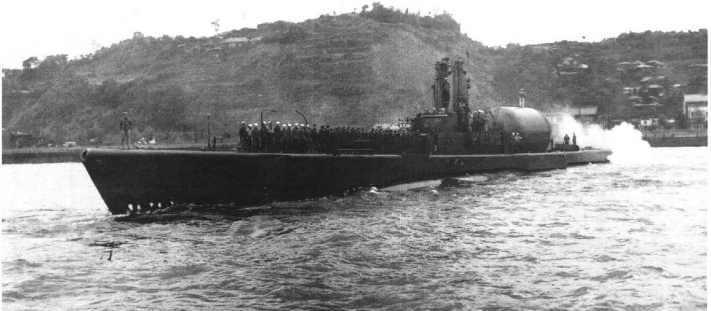
National Archives Photo (USN) 80-G-421628

Royal Marines line the deck of the USS Perch (ASSP 313) as the submarine leaves Japan for Korea. Commissioned in 1944, the Perch operated out of Hawaii and Australia during World War II and was one of only two submarines to receive the Submarine Combat Patrol insignia during the